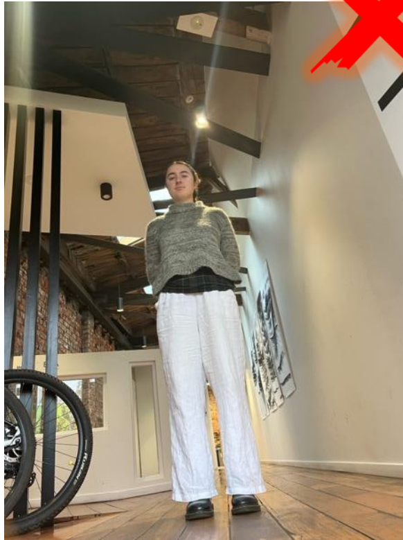
Setting up on ground at a low angle