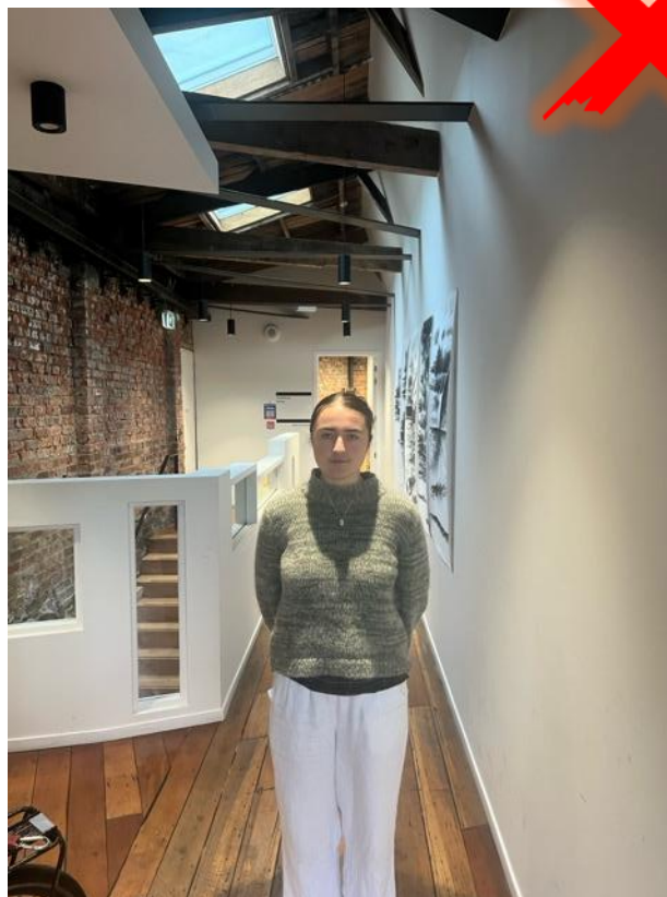
Standing right under lighting or into the sun can cast hard shadows