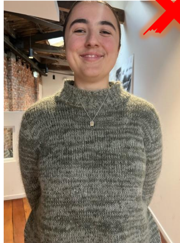
Too close – cutting off head