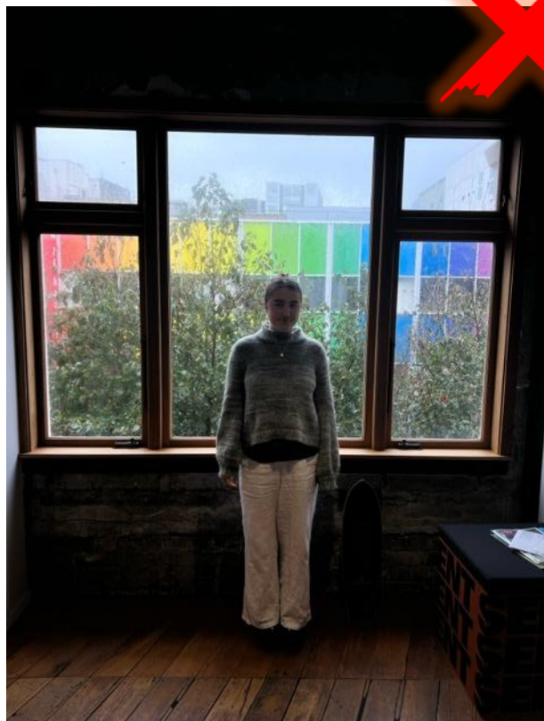
Window/Lighting behind casts a shadow